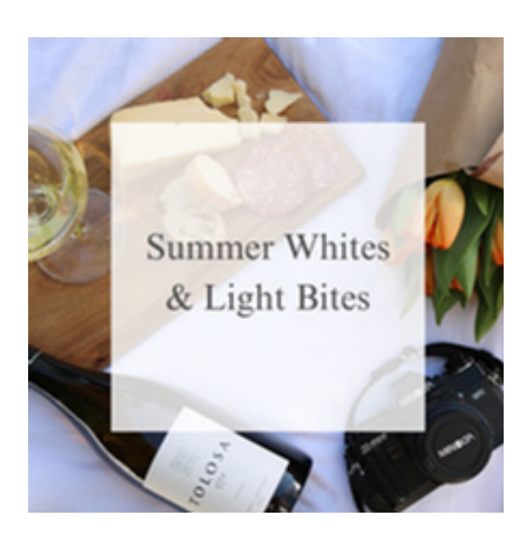
Summer Whites & Light Bites

Sunday, June 29<sup>th</sup> | 2pm - 4pm